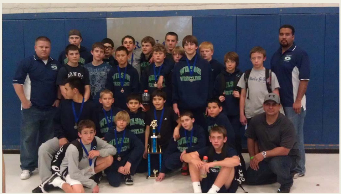
Members of the Wilson Wrangler Wrestling Team with their First Place trophy.

The Wilson Wrangler Wrestling team is off to a great start. On January 14, the team competed in the 2012 Coronado Fall Classic wrestling tournament where they placed 2 nd overall.