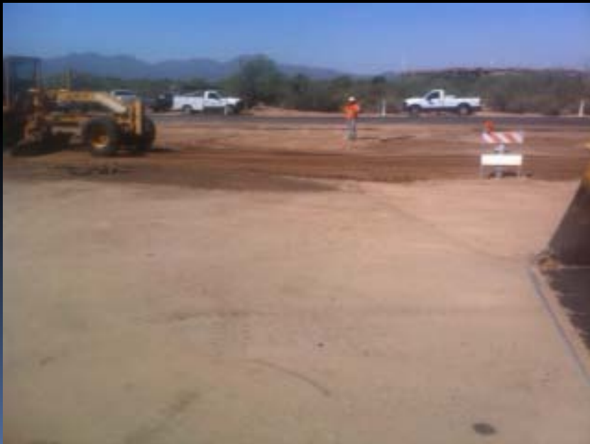
Walker West Parking