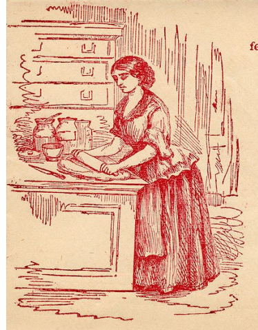
If I cannot fight. [Pictorial envelope]

aid societies established schools within Union lines, and both children and adults attended enthusiastically.