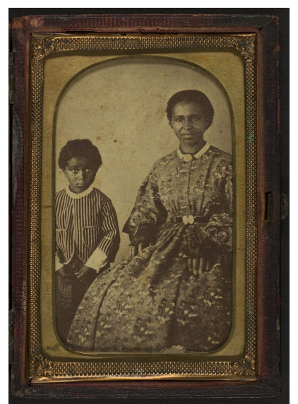
[Full-length portrait of an unidentified woman, seated, and full-length portrait of a child standing on her right, both subjects are facing front] [between 1860 and 1870]

In addition to the challenge of everyday subsistence, ex-slave women had to deal with such other problems as lack of warm clothing and good shelter, rampant illness (contraband camps had extremely high mortality rates due to disease), abuse from soldiers, and the transitory nature of life within a war zone. To cope, many women helped each other and drew on the resilience they had learned while enslaved. African American women also took advantage of the benefits of freedom, especially the opportunity to learn to read and write. Northern