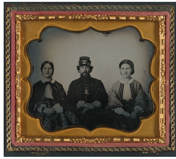
[Unidentified soldier in infantry uniform sitting between two women, probably relatives]

Compared to previous generations, American women as a whole had improved their educational standing, secured additional legal rights, and acquired greater access to manufactured goods by the mid-1800s. Women had participated prominently in the religious revivals known as the Second Great Awakening that swept across the country. As one result of this religious fervor, American women, particularly in the North, became