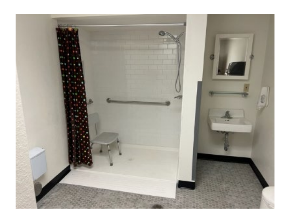
AHS Nurses Office Improvements