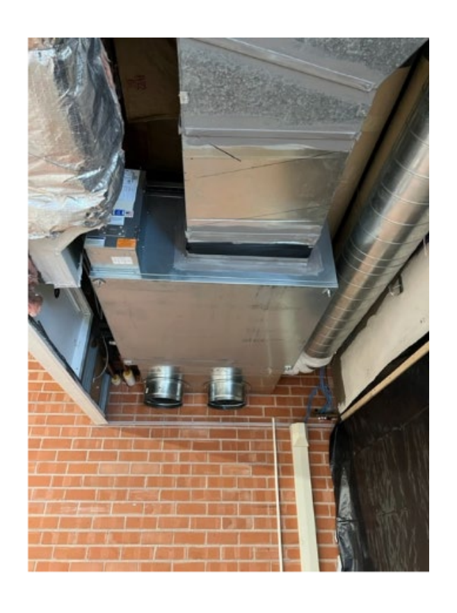
AHS 100 & 200 Wing Fan Coil Replacements