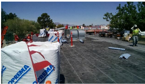
Roof at Keeling Annex

Electrical service & exterior lighting will be reviewed in the future