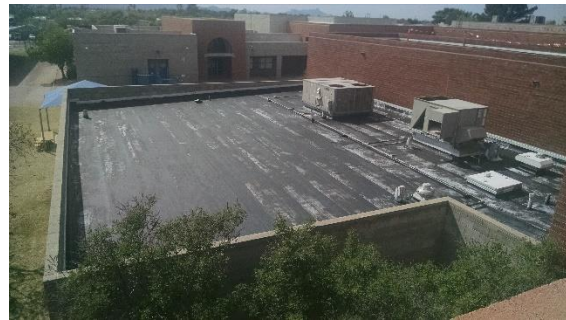
Keeling Administration Roof