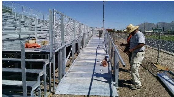
New Visitor Bleachers