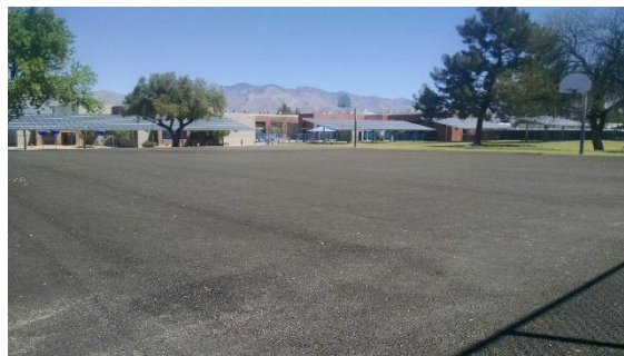
Newly Paved Basketball Court