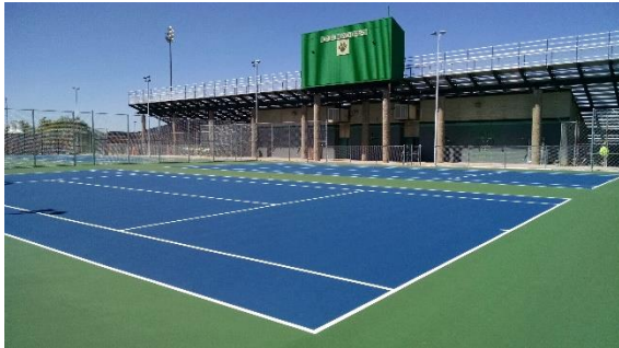
New Tennis Courts

Student commons area ADA restroom construction