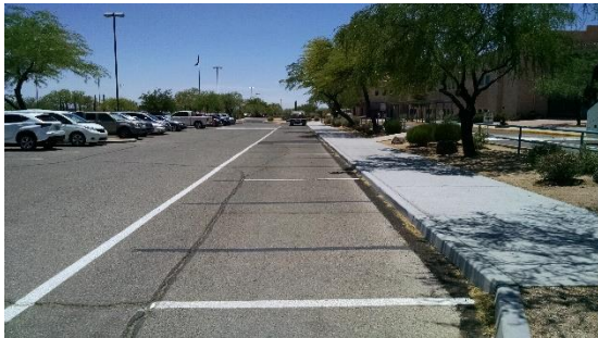
Parent Pick-up / Drop-off