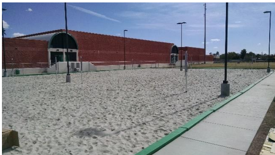
Beach Volleyball Court