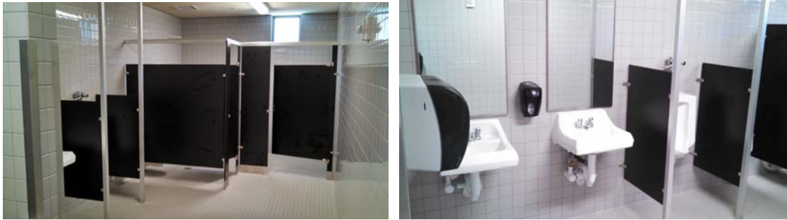
New Restroom in New Harelson Classroom Building

Restroom additions and renovations are complete and in use.