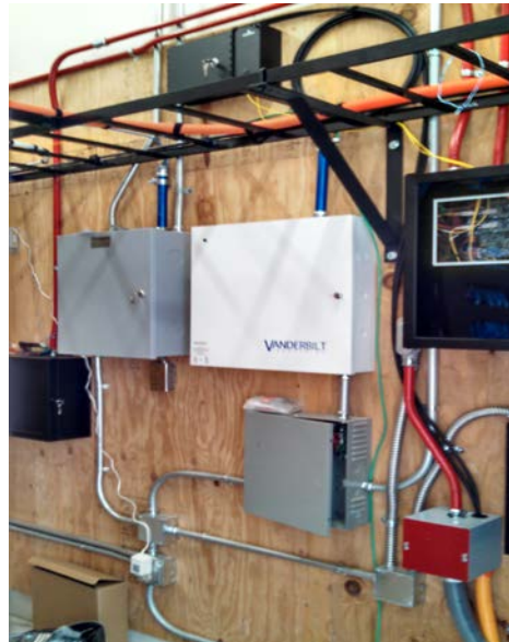
New IDF (intermediate distribution frame)