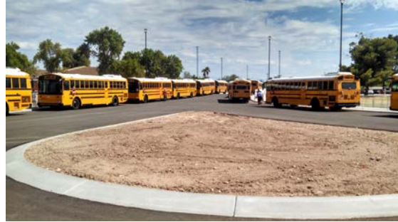
Cross New Bus Loop