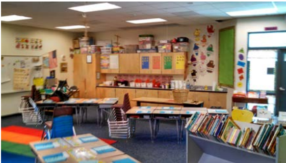
Two New Typical Classrooms