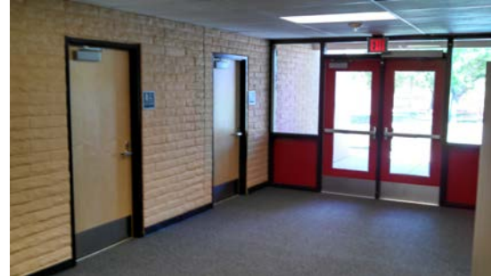
West Vestibule Addition - Staff Restrooms

Campus wide restroom renovations and additions are complete and in use. Covered walkway repairs in the 100 through 400 wings are complete.