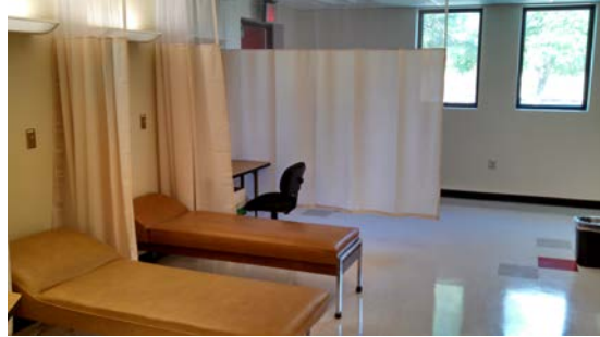
Health Office Addition - Triage