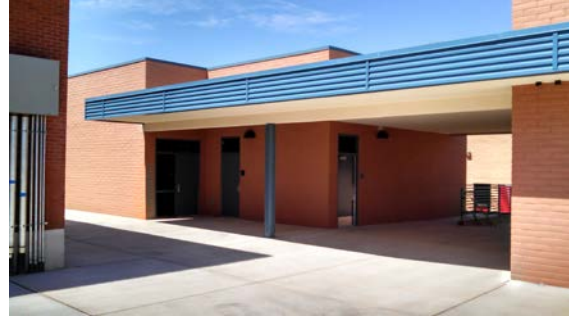
New Harelson Classroom Building