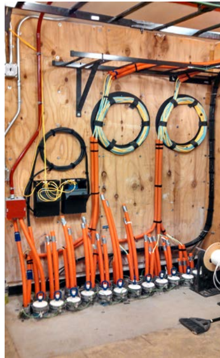
New MDF (main distribution frame)

Punch list corrections and above ceiling demolition of abandoned systems are in process during “off hours.”