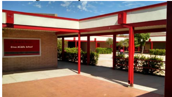
Renovated Covered Walkways

Sound attenuation in the MPR is complete.