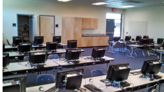
New Computer Lab and Video Presentation Room

The new music room added to the south side of the Fun House is complete and in use.