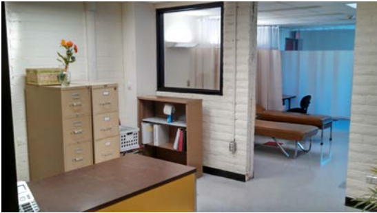
Renovated Health Office Reception

The Administration Building improvements which include a renovation of the reception area, a staff restroom addition, and a health addition and renovation are complete and in use.