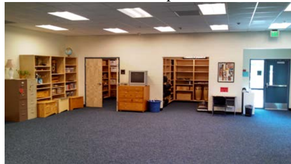
New Harelson Music Room

Renovation of the fourth grade pod building is complete and in use.