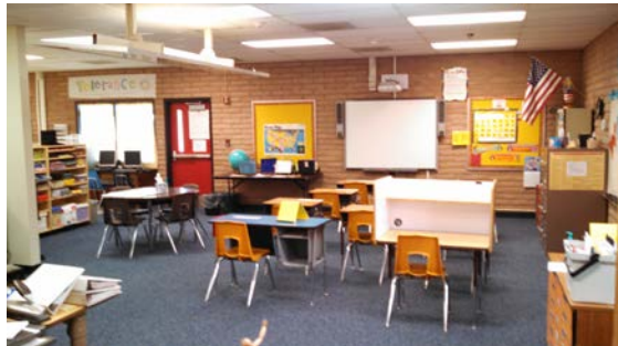
Renovated Cross Categorical Classroom