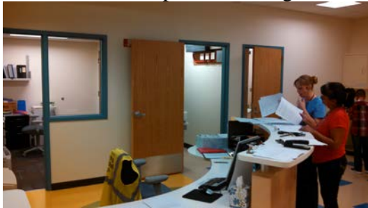
Wilson Health Office Reception

The renovated health office is 98% complete and in use. Punch list and above ceiling corrections are in process during “off hours.”