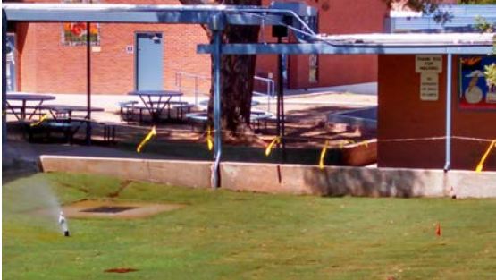
Storm Water Evacuation Improvements

New security fence is installed and final painting is in process during “off hours.”