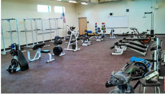
New Weight Room

Site work, including a new bus loop and storm water evacuation improvements are complete.