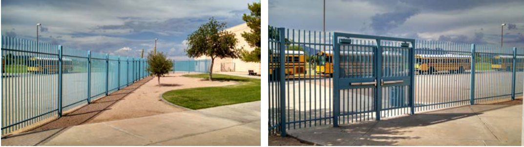
New Security Fence and Pedestrian Gates

The Wilson project is on budget and on schedule.