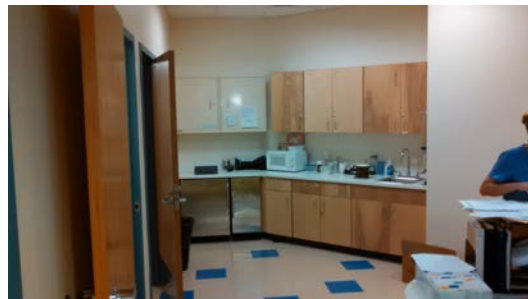
Wilson Health Office Work Area