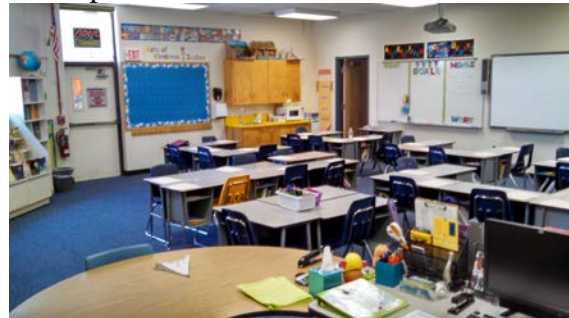
Four Renovated Classrooms (4 th grade pod)