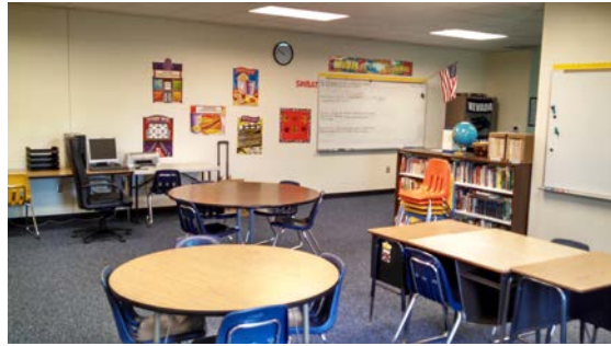
New Cross Choices Room