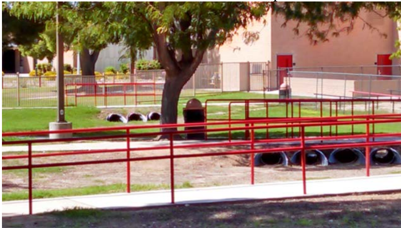
Cross Storm Water Evacuation Improvements