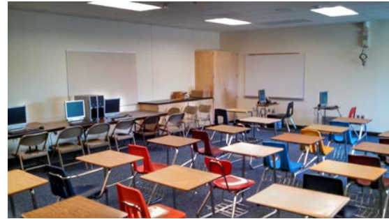
Three New Typical Classrooms & Two New Distance Learning Classrooms