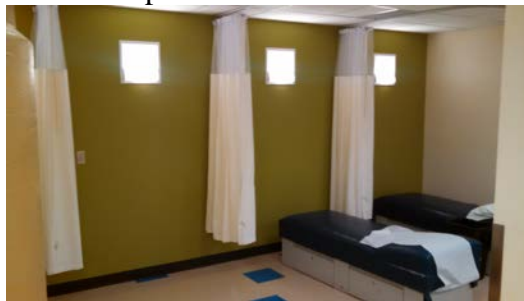
Wilson Health Office Triage Bay