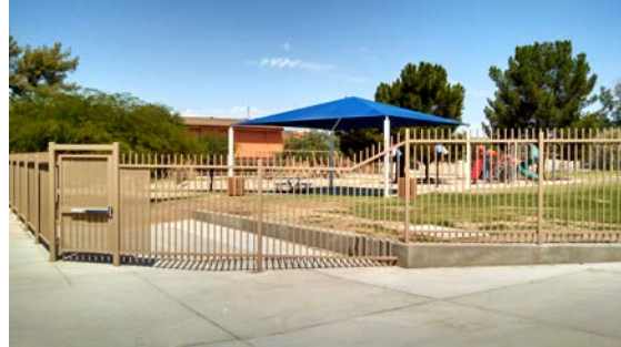
New Campus Security Fence