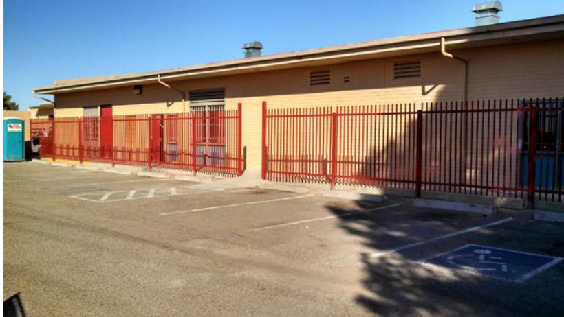
New Security Fence

New mass notification system (fire alarm system) is complete and in use. New security fence is installed and final painting is in process during “off hours.”