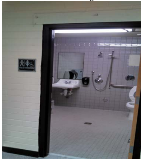
New ADA Compliant Restroom in Cross Categorical Classroom