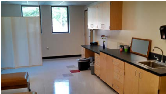
Health Office Addition-Triage Work Area